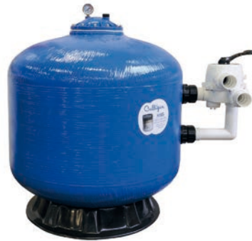
Semiautomatic and Automatic multi-media Filter